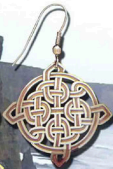
CE01NC Square Knot