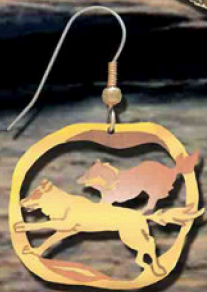
NA35BC Running Wolves