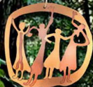
GD11BC 4 Dancing Women