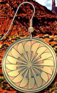
ID13BC Feather Shield