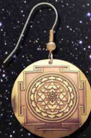
SS03BC Sri Yantra