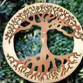
GD16NC Tree of Life