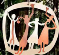
GD11NC 4 Dancing Women