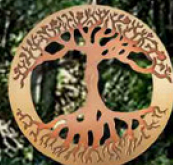
GD16BC Tree of Life